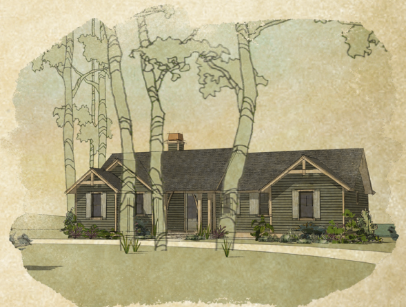
Street Side Elevation

3 bedroom Plan | Total square feet - 1,641 | Conditioned sq. ft. - 1,302